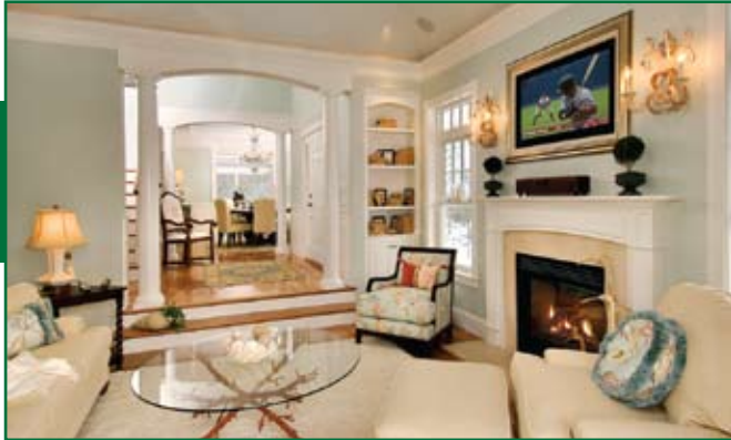
The Village at West Gloucester... where 55+ living means not having to compromise on luxury.

As a homeowner at The Village, your richly appointed residence, featuring architectural detailing reminiscent of stately homes of the nineteenth and early twentieth centuries, will be a constant source of pride and comfort. With an exterior house design in the traditional “Shingle Style” of architecture, a style common in the coastal areas of New England, The Village shares an architectural heritage with some of the finest homes on Cape Ann. With standard interior design features that include classic columns, raised-panel wainscoting, interior transom windows, hardwood floors, porcelain tile, cherry wood cabinets, granite counter tops, stainless steel appliances, claw foot slipper tub, and the like, the Village at West Gloucester is clearly an address of distinction where luxury is standard.